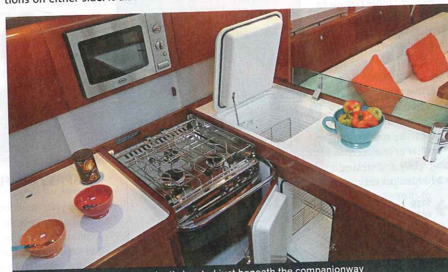
The L-shaped galley is conveniently located just beneath the companionway

The U-shaped dining area is to port in the saloon, facing a short settee that adjoins the nav table. The L-shaped galley is also to port, is convenient to the companionway and is strategically located where motion in a seaway is most subdued. The entire saloon has a contemporary look about it, enhanced by the varnished wood joinery and suede fabric upholstery. If you